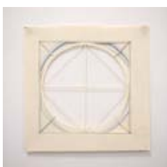
50 Sophie Wolfson Keeling Segments 2010 Pencil and gouache on paper 32 x 32 cm