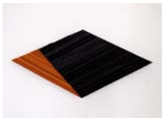
15 Federica Nadalutti Field 2011 Cardboard and ink 17 x 17cm