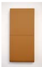
11 Arpad Forgo Ochre Bipolar (Okker Kétpólusú) 2010 Acrylic on wood 46 x 20 cm