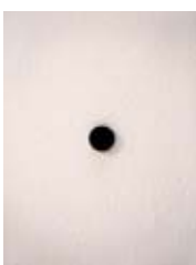
52 Amarie Bergman Essence of the Eternal matter of the Mind 2012 Velveteen, Plastic, Tin, Perfume (Marrakech by Aesop) 1.3 cm