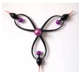
34 Kiwon Hong Untitled 2010 Mixed media 60 x 65 cm