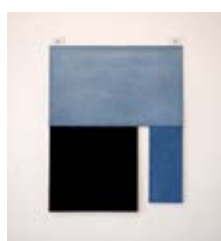
10 Lynne Eastaway Untitled Blue / Black 2008 Acrylic Gouche on laminated cotton duck 46 x 20 cm