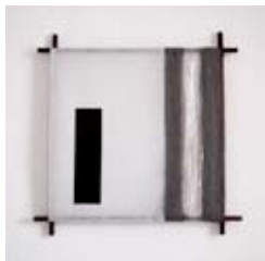
31 Myrianne Perelmutter Iron and Paper 2010 Steel paper plastic 24 x 24cm