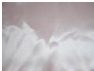
39 Beverley Southcott City and void one 2012 Inkjet on german etching paper 32 x 42 cm