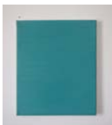
33 Unknown Artist 30 x 25 cm