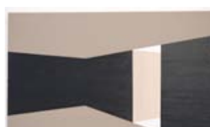
24 Guido Winkler 9VI 2006 60 x 35 cm