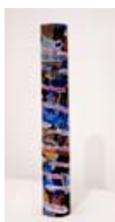
47 Tony Green Tennis 2012 Cardboard and acrylic paint with words 17 x 5 cm