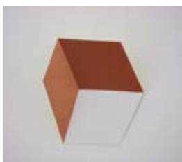
55 Henriette van't Hoog Untitled 22.5 x 21 x 8