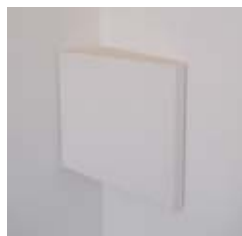
12 Suzie Idiens Untitled (Wedge) 2011 Pine Primed canvas 26 x 30 x 11cm