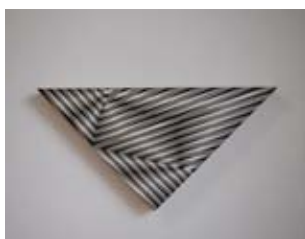
21 Gilbert Hsaio Untitled 2008-9 Acrylic on canvas 22 x 42 cm