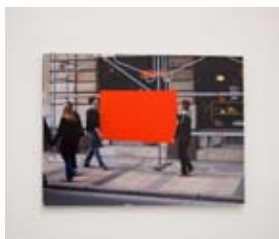
49 David Attwood Moving Monochrome (Simon) 2011 11 x 15 cm