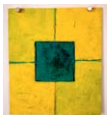
64 Louise P Sloane Untitled Yellow Study 2010 Acrylic polymers, paint and gouache 8 x 7 inches