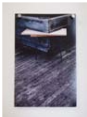
45 Alexander Jackson Wyatt Time Intime Out 2012 Digital print on archival paper 24 x 15