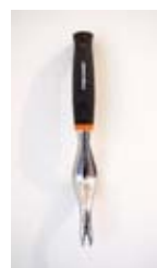
48 Nigel Lendon Le monde de l'art a la langue fourchue 2008 Metal and handle 33 x 6 cm