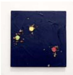
46 Antoine Nelen Pierced 3 2011 Acrylic on wood and cardboard 30 x 30cm