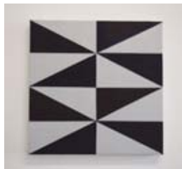
18 Susan Andrews Untitled 2012 30 x 30 cm