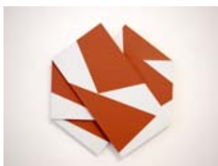
9 Joel Besse Untitled 2011 Acrylic on wood 30 x 30 cm