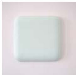
3 Richard van der Aa Reasons to be Cheerful (Sugar Mountain) 2011 Mixed media 30 x 30cm