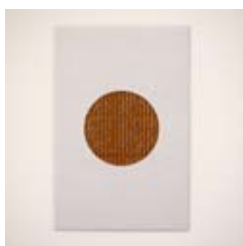
5 Ben Raynor Untitled 2012 20 x 13 cm