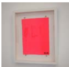
13 Giles Ryder Fluorochrome Pink Pigment on Paper 41 x 48 cm framed