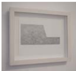
29 Pollyxenia Joannou Angle left 2008 Graphite 27 x 33 x 4 cm