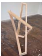
57 Ken Villa Construction #1 Point to point pine 102 x 90 x 60 cm