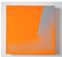
35 Helen Smith Hard edge #4 2009 Oil on canvas 27 x 27 cm