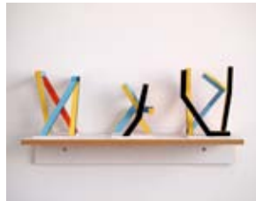
28 Trevor Richards Modes of Reality #2 2012 acrylic on balsa wood 48 x 40 cm