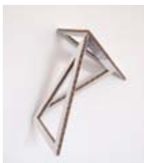
54 Jacek Przybyszewski 3 Triangles/8 variations 1 2010 Acrylic on aluminium and cardboard Dimensions variable