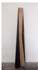
41 John Adair Thoughts .2 2011 Acrylic on two timber particle blocks 86 x 7.5 cm