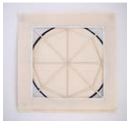
32 Sophie Wolfson Keeling Segments 2010 Pencil and gouache on paper 32 x 32 cm