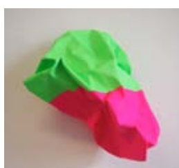
20 Ludovica Gioscia From the Pack Store and Clean series 2010 acrylic on paper 35 x 30 x 20 cm