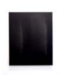
19 Matt Allen Black Painting 2012 Acrylic on canvas 60 x 50 cm