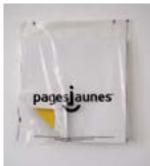
17 Roland Orepuk Cut Painting with Yellow Angle 2011 Arcylic on canvas in plastic bag 30 x 30cm