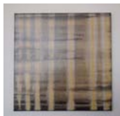
40 Jeremy Kirwan Ward Untitled 2011 Acrylic on canvas 40 x 40 cm