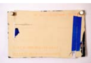
63 Shannon Lyons Summer Dream Double 2012 Paper 17.5 x 10.5 cm