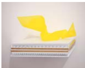
51 Sara Givins Yellow Crease White Angles 2012 Corflute polypropylene pine plywood 20 x 40 x 26 cm