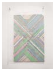
42 Alex Selenitch Diagonal textile pg 183 1998 Felt pen and liquid paper on found page 25.5 x 16 cm