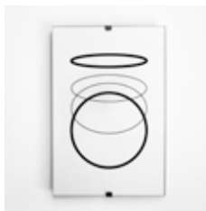
43 Belle Blau The Look of Sound: Tipped Bottle 2011 Inkjet print on Mohawke Via paper, behind glass 100 x 150 cm