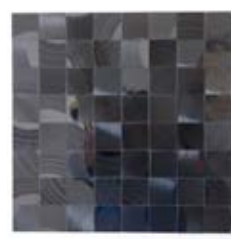
36 Manne Shultz Maquette for Battlefield 2011 Plastic Aluminium 48 x 49 cm Starting price $300