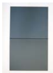
14 Matthew Allen Two Greens 2012 Oil on Linen 101 x 61 cm