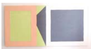
61 Karen Schifano Wall-Eyed #3 2010 Oil on panel 6 x 12 inches