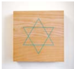
4 Adrian McDonald Zion 2012 30 x 30 x 6cm