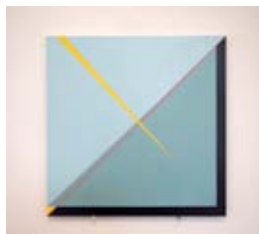
16 Melanie E Khava Ohne titel: altho (thoughts on distance and its awkwardness) Series 2. One 2012 Paint on Board 30 x 30 cm