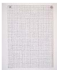
62 Rene Eicke Changes 2012 Ink on paper 30 x 21 cm