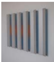
37 Andrew Leslie Exit Left 2012 Acrylic on anodised aluminium 54 x 85 cm