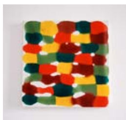
6 Marie Thurman 3 Passage Pigments and acrylic on canvas 30 x 30cm