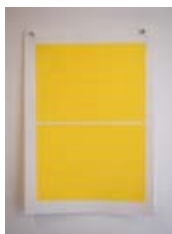
53 Melissah Chalker Untitled 2012 50 x 35 cm