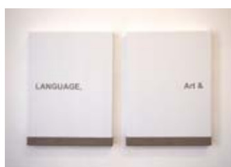
8 PJ Hickman Lexicon Series (Art + Language) 2012 Diptych 41 x 31 cm