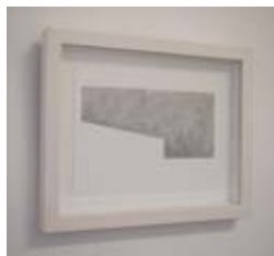
30 Pollyxenia Joannou Factory 2008 Graphite 27 x 33 x 4 cm