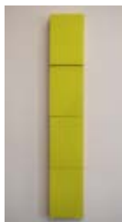
1 Melissah Chalker Untitled, 2012 Acrylic on plexiglas 60.5 x 10 cm