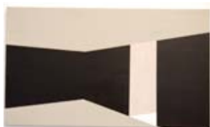
23 Guido Winkler 9VI 2005 60 x 35 cm