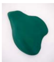
22 Artist Unknown Modes of Reality #2 Acrylic on Balsa wood 2010 48 x 40 cm