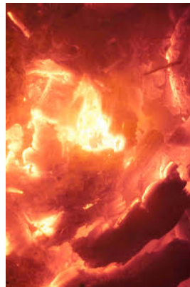
Golden Horde 2016